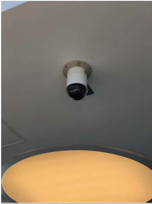
(4-01) ELEVATOR LOBBY 401 - PTZ Camera - Not working - Next to Stairwell #1 and Public Restrooms