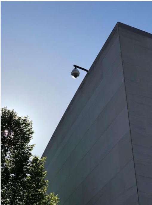
(E-12) NORTHWEST CORNER - PTZ Camera – Broken facing down – Along E. Jefferson St towards N. Washington St on the corner of the building above trees