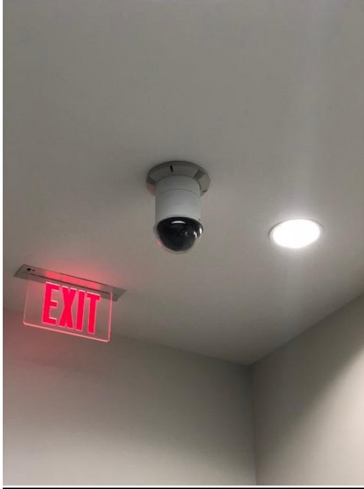
(1-04) ELEVATOR LOBBY 110 - PTZ Camera – Not working - Next to Stairwell #1 and Public Restrooms