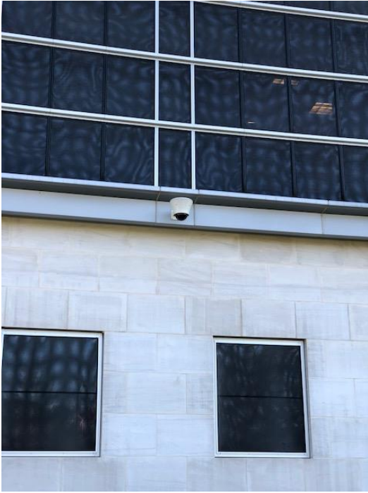
(E-06) SOUTH FACE - PTZ Camera – Not working – Along Vinson St, camera on the left, closes to ramp, under the window