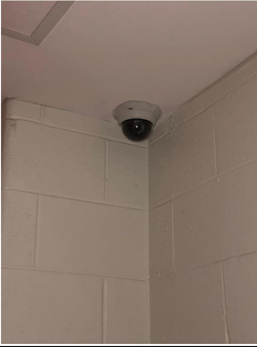
(D-03) CORRIDOR 153B - Fixed Camera – Not working - Dayroom Hallway, camera is next to door leading outside to the ramp