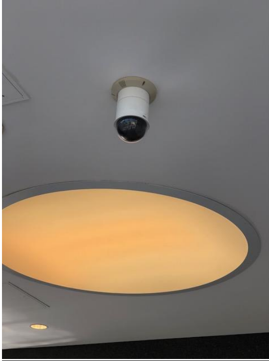
(6-01) ELEVATOR LOBBY 601 - PTZ Camera - Blurry - Next to Stairwell #1 and Public Restrooms