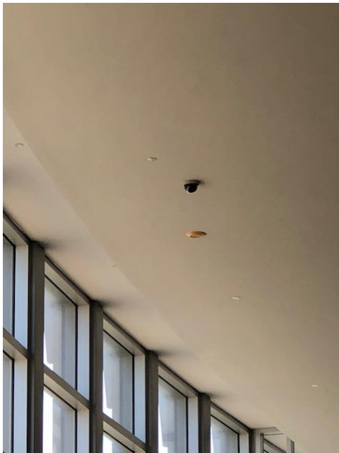
(1-08) MAGOMETER GRAND HALL 101 – Fixed Camera - Bug/Dirt in camera and obstructs some of the view - Above Bailiffs/Metal Detector