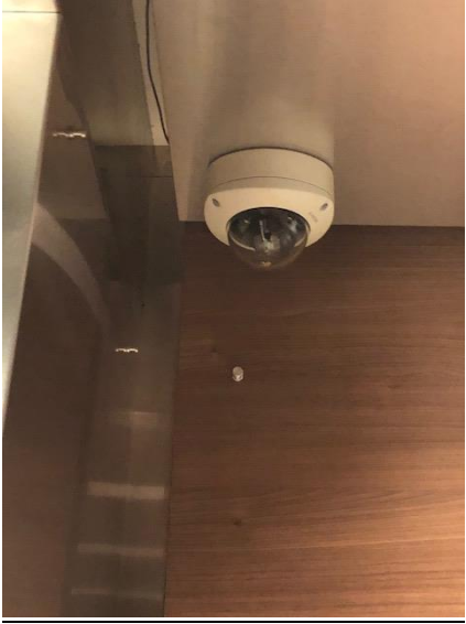
(EL-02) P3 - Fixed Camera - Not working – Camera inside of elevator