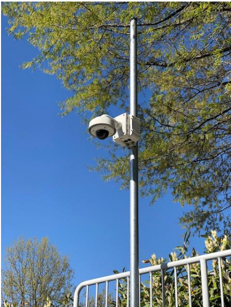
(E-01) ENTRANCE GATE - Fixed Camera - Freezes or Goes In and Out - Diagonal from gate in rear of building