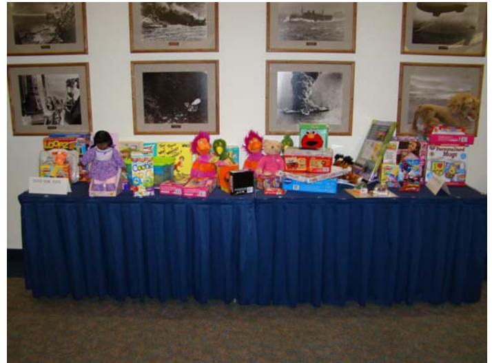
Attendees at the convention were given the opportunity to participate in a U.S. Marine's Toys for Tots toy drive.