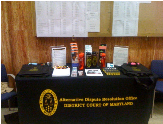
The District Court ADR Office hosts a Conflict Resolution Day event at the Baltimore City District Courthouse (Fayette Location).

Open House events included staffing display and information tables in public areas of District Courts to distribute materials about mediation and District Court ADR programs and services to the public and court employees. In some locations we were joined by our local community mediation center (CMC) partners who distributed literature about their local center. In other instances the local CMC provided their information for District Court ADR staff to distribute.