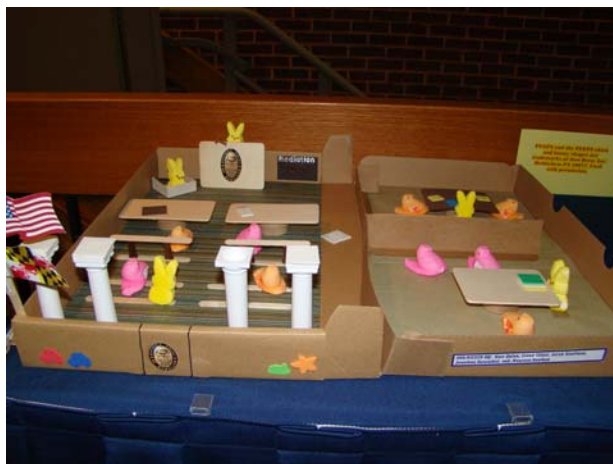
District Court of Maryland ADR Office staff members displayed their PEEPS diorama at the Maryland Mediators Convention.