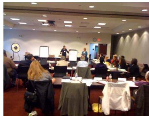
ADR Staff present at new volunteer orientation on October 5, 2010 at the Judicial Education & Conference Center in Annapolis.