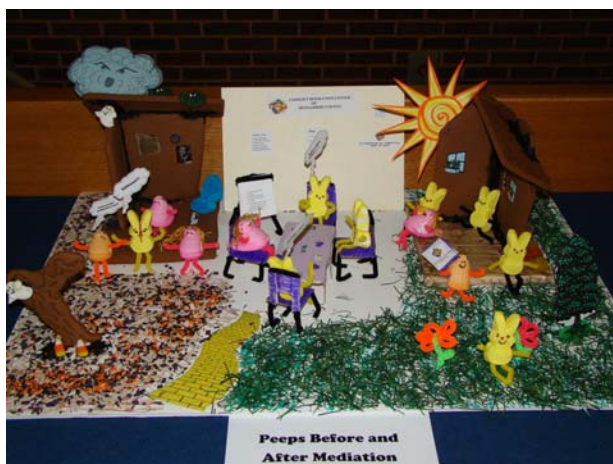
Conflict Resolution Center of Montgomery County was the proud winner of the PEEPS diorama contest.