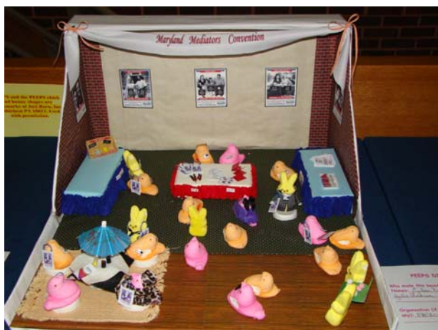
Maryland Judiciary's Mediation and Conflict Resolution Office (MACRO) PEEPS diorama.

participants through a series of scenarios involving potential ethical dilemmas. Using both small and large group discussions, participants shared ideas and reflected on whether the policies and procedures of a particular venue or entity may affect the appropriate response to the ethical dilemma.