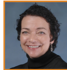
Judge Nancy Purpura Circuit Court for Baltimore County, Presiding Judge, Drug Court