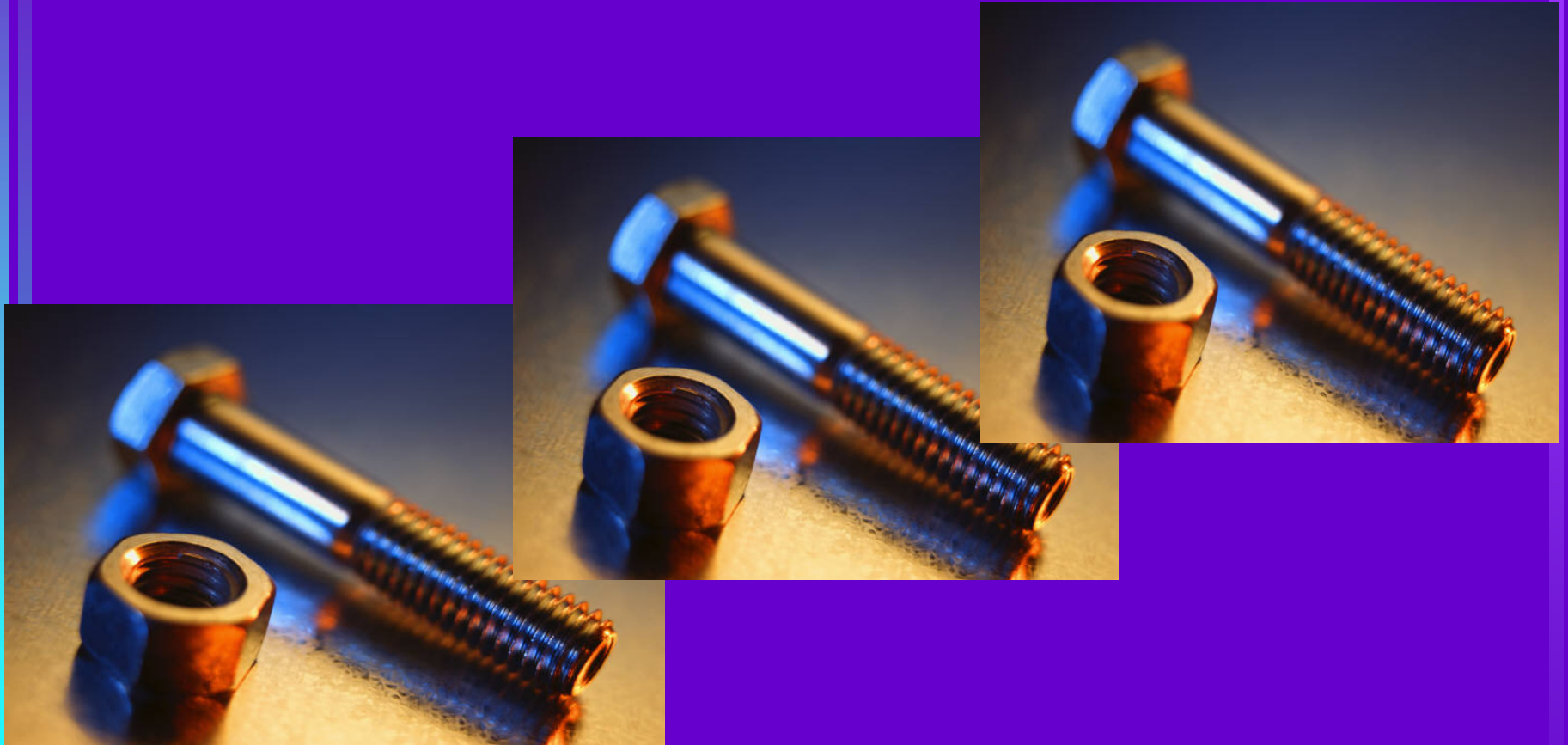
Nuts and Bolts