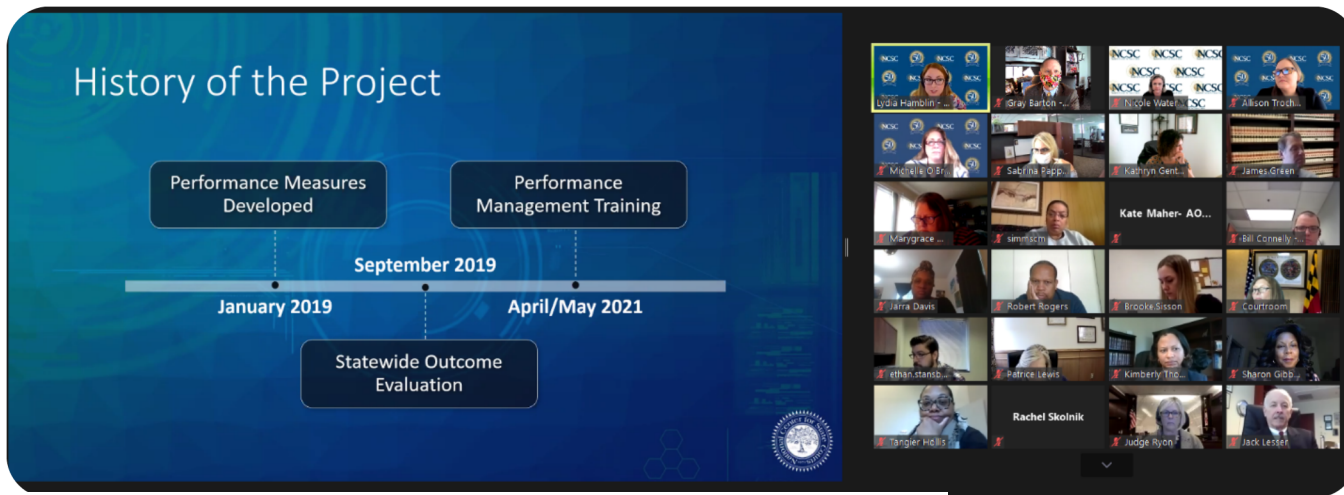
Figure 8: Mental Health Court Performance Measure Virtual Training, May 2021

The final component to the performance management system is to provide a comprehensive training to mental health court teams on how to use the performance measure framework to assess performance and make any necessary modifications. Following a nearly 12-month delay caused by COVID-19 restrictions, in May of 2021, NCSC, in collaboration with the Maryland Judiciary, provided a court-based virtual training using realistic scenarios that represent performance issues and challenges frequently encountered by mental health courts (Figure 8). These scenarios also demonstrated how performance measures can be used to address an issue. The training was provided in 4-hour segments over three Fridays in May to all mental health court teams members including judges, court administration, community-based treatment providers, and staff from local state’s attorney’s offices and the Office of the Public Defender, parole and probation, and local law enforcement. All participants left the training with a framework for mental health court performance measure implementation.