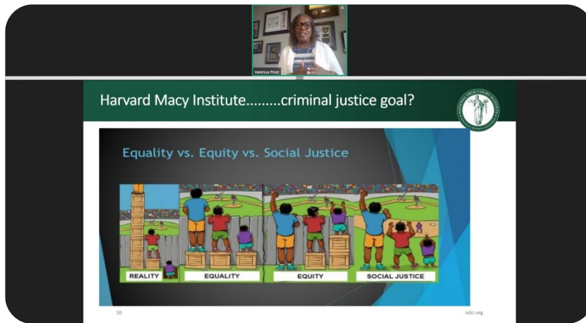
Figure 7: Vanessa Price, Director, National Drug Court Institute leads an “Equity and Inclusion in Problem-Solving Courts” Lunch and Learn virtual training session.

restrictions. OPSC’s Lunch & Learn series filled the void for hundreds of problem-solving courts practitioners across Maryland and reflected topics relevant to all of OPSC problem-solving courts, including, “Equity and Inclusion in Problem-Solving Courts”, “Conflict Resolution in Problem-Solving Courts”, “Dispelling Drug Testing Myths”, and “Trauma Informed Courts (Figure 7).”