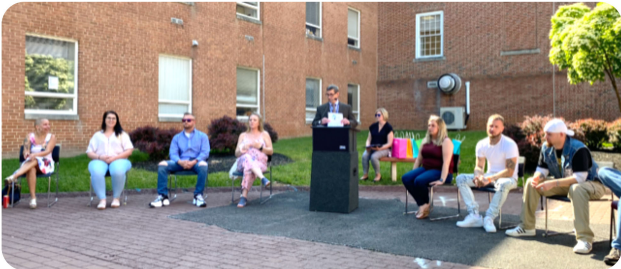
Figure 4: Judge Fred Hecker recognizing recent graduates at Carroll County Circuit Adult Drug Court’s 33rd Drug Treatment Court Graduation.