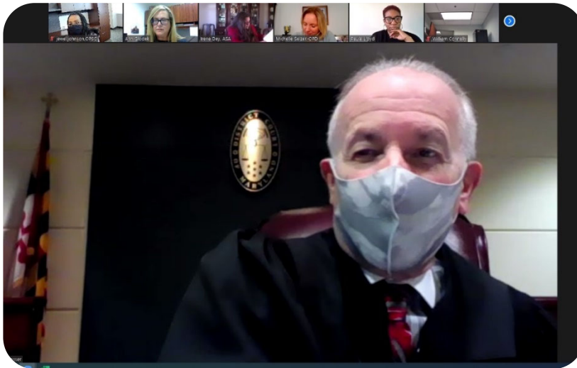
Figure 9: Judge Jack Lesser presides over Baltimore City District Mental Health Court.

In Maryland, as in other states, those with mental health are increasingly becoming involved in the criminal justice system. Mental health courts were established in response to the increased numbers of individuals with mental health disorders found caught in the revolving door of the criminal justice system. See Table 3 for a comprehensive list and basic information of all mental health courts.