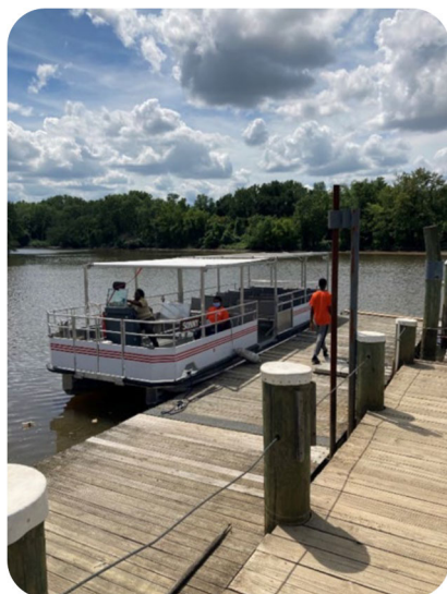
Figure 10: Students begin to board the pontoon boat in Bladensburg Waterfront Park for a tour of the Anacostia River.

As Maryland’s schools continued remote learning throughout the 2020-2021 school year, identifying new students who were truant continued to be challenging. Factors such as varied attendance tracking among schools, enforcement leniency, and use of assignment completion as means for tracking attendance, contributed to this challenge. Nonetheless, Maryland’s Truancy Reduction programs welcomed 241 new students and their families into their programs and continued to make contact with current participants; providing needed resources and motivation to continue with their lessons.